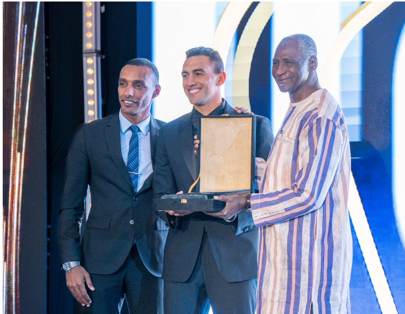
Paris 2024 Olympic champion Ahmed Elgendy (EGY) collects his award after being named as 2024 Senior Male Pentathlete of the Year