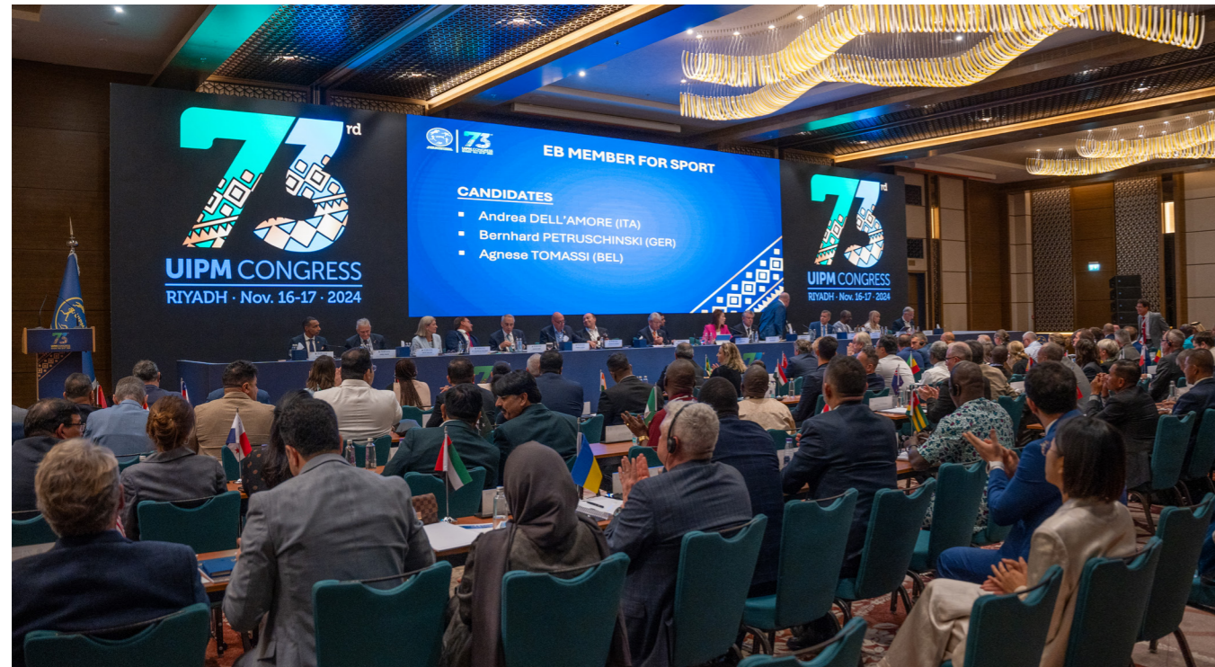
Votes are cast during the election of the UIPM Executive Board Member for Sport during the 73rd UIPM Congress, which took place in Riyadh (KSA).

the way that we are working with the Organising Committee and the US Olympic & Paralympic Committee.